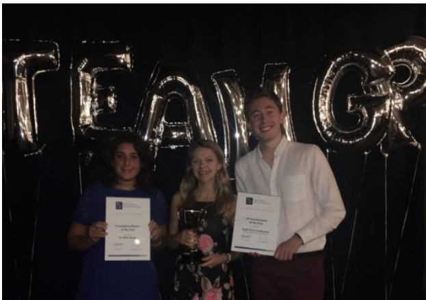
Winners of: GP Society Event of the Year